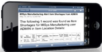
Alerts received on any email enabled device